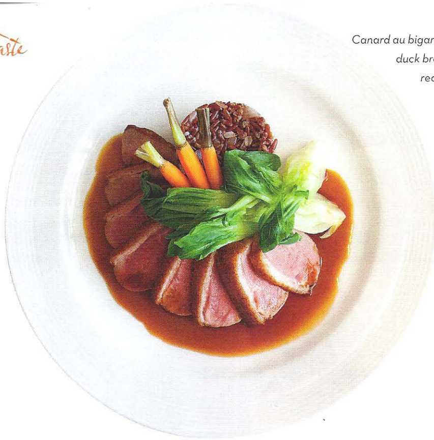
Canard au bigarade, pan-seared duck breast with French red camargue rice.